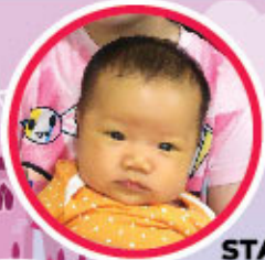
STANLEY'S 5 August 2021