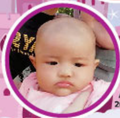
ARIFF'S 26 August 2021